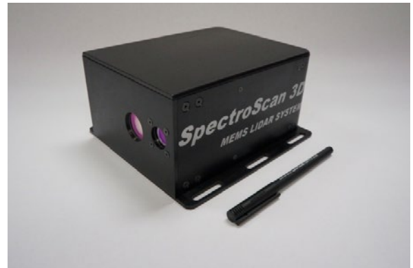
Figure 1. LiDAR system block diagram (left) and first generation commercial unit (right).