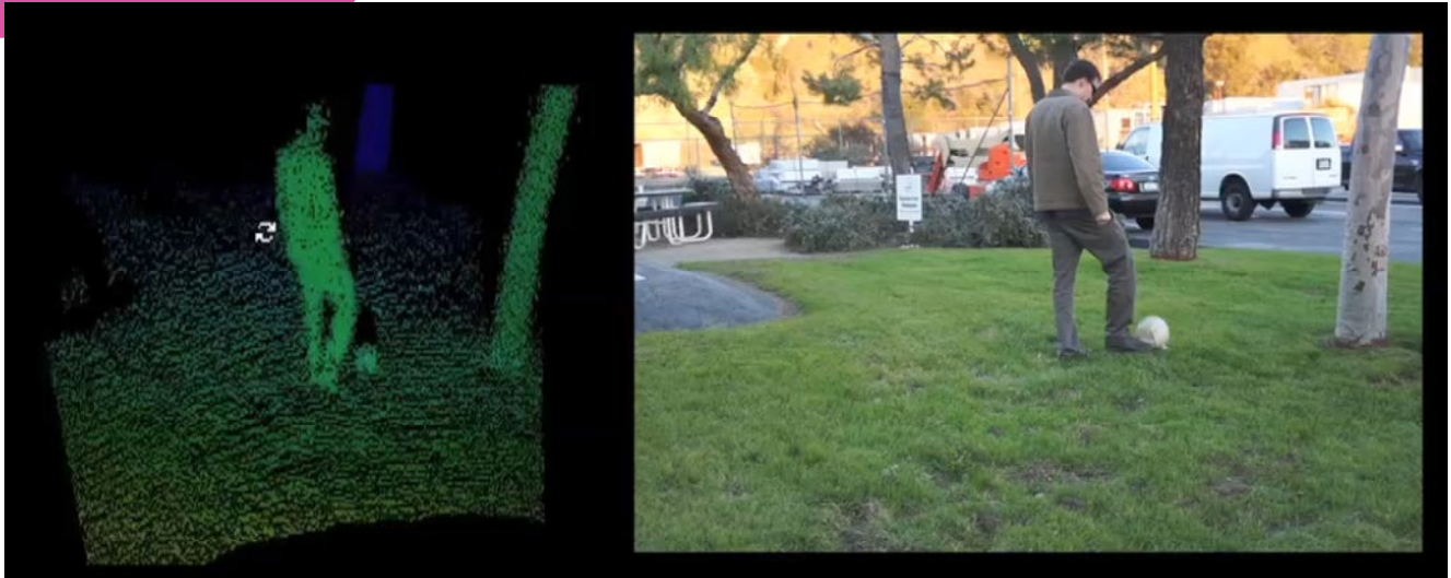
Figure 3. Outdoor imaging with point cloud data (left) next to a standard color camera image of the same scene (right).

This process is repeated sequentially for each of the 256(Horizontal) x 128(Vertical) pixels per frame. The image frame data (amplitude and range for each pixel) is transmitted via Ethernet for display at a 5 Hz frame rate. The maximum range of this model of LiDAR camera is 20 to 25 meters, depending on target reflectivity. The minimum range is less than 6 inches.