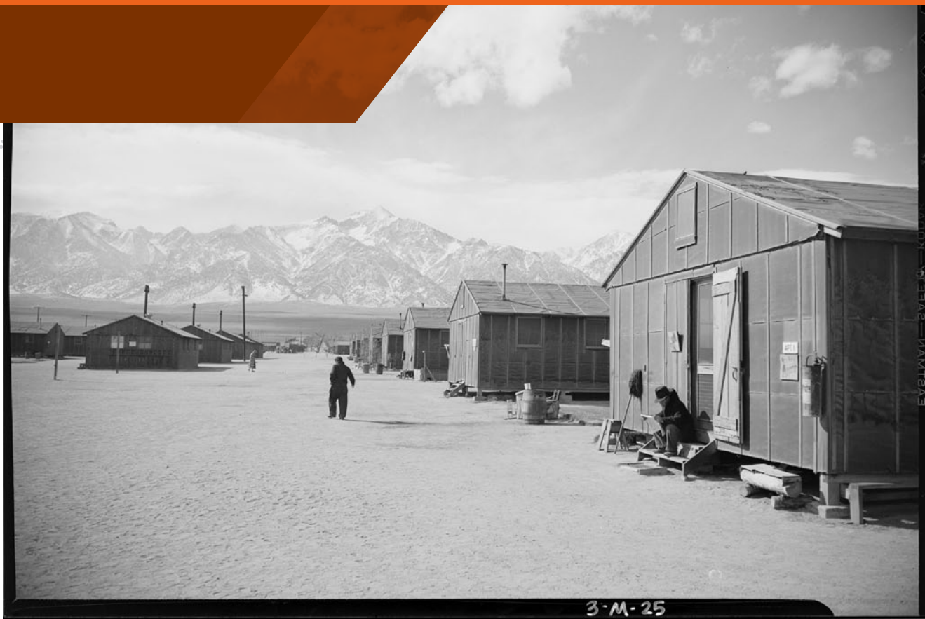
Historic Image of Manzanar courtesy of the Densho archive.