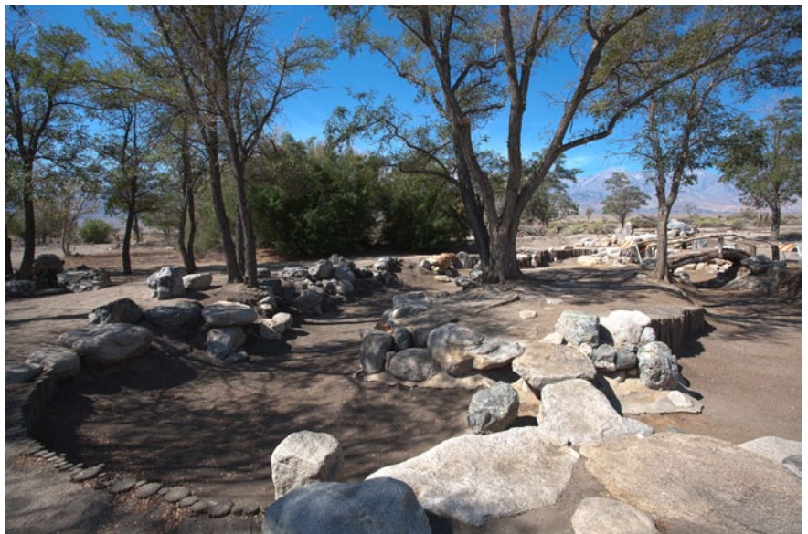
Photograph of Merritt Park at Manzanar today.