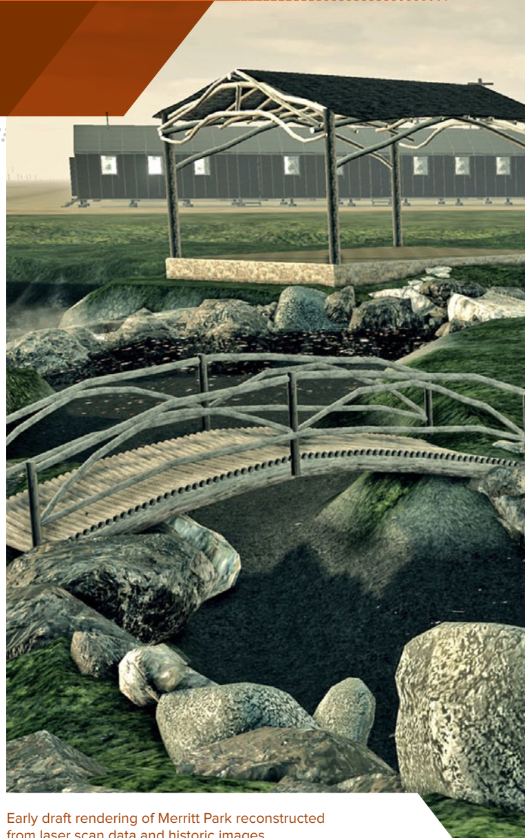
Early draft rendering of Merritt Park reconstructed from laser scan data and historic images.

S hortly following the bombing of Pearl Harbor, President Franklin Roosevelt issued Executive Order 9066 which would affect all people of Japanese ancestry living on the Pacific Coast. In 1942, Executive Order 9066 resulted in the forced removal of over 110,000 Japanese Americans from their homes in California, western Oregon, Washington, Hawaii and southern Arizona. 62% of those moved were